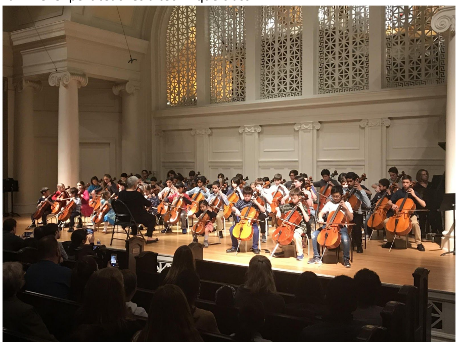
Cello students join together for a play-in.