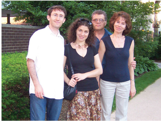
Evanston, Illinois, 2006