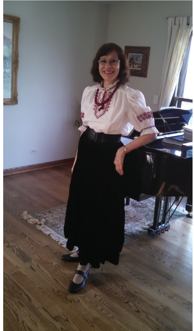
Highland Park, Illinois, 2016