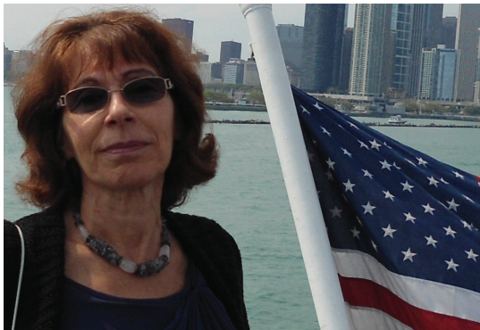
Chicago, Illinois, 2013