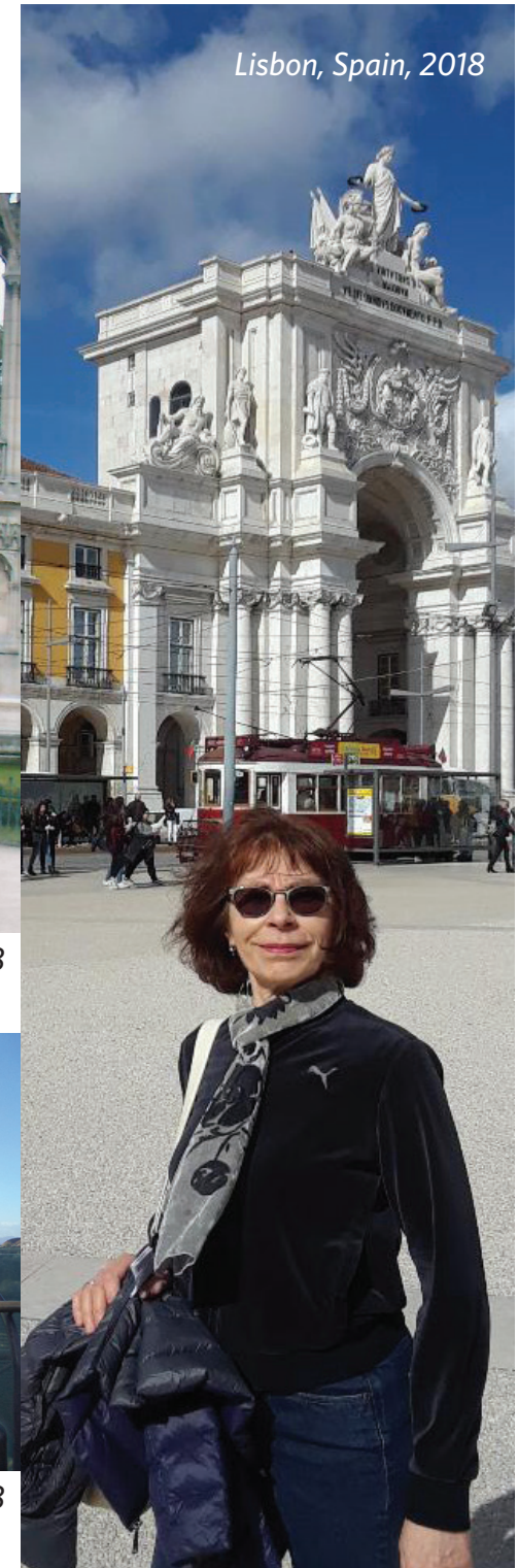
Lisbon, Spain, 2018