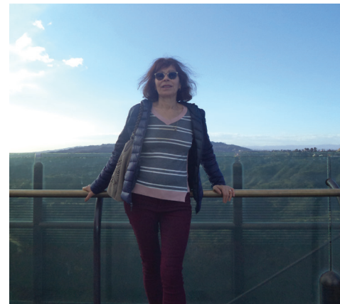
Griffith Park, Los Angeles, 2018