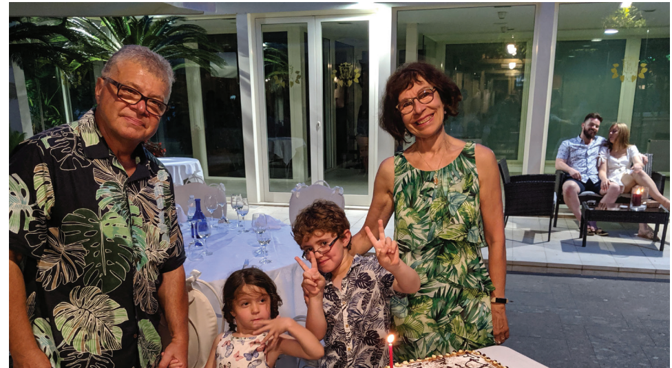
Summer 2019 Capri, Italy

In the last year of her life, somehow those differences disappeared.